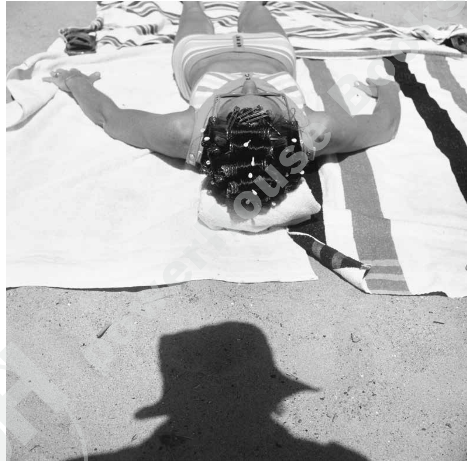
July 27, 1971 - Chicago