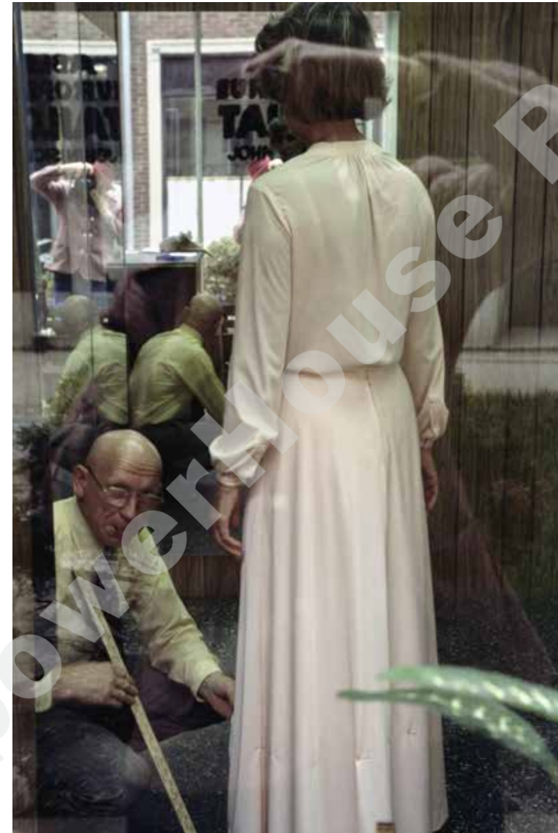
June 1978 – Chicago area