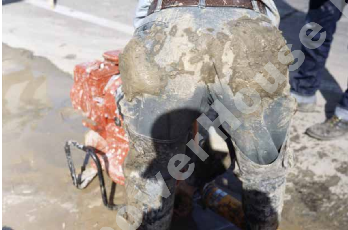
November 1977 – Chicago area