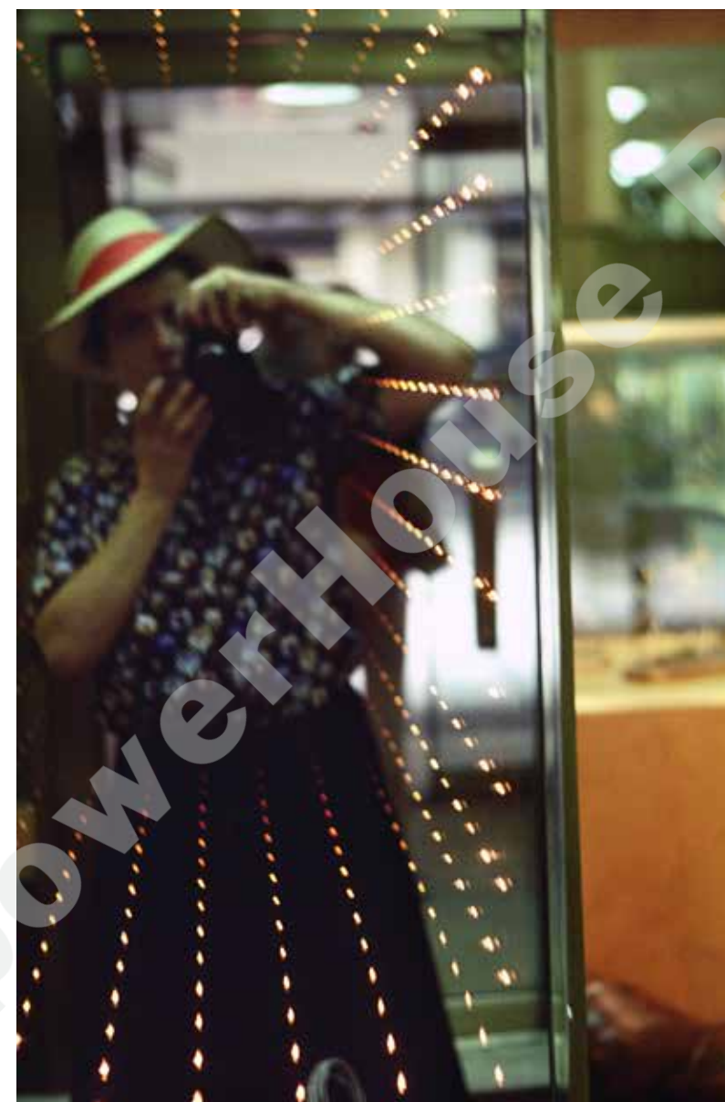
August 1976 – Chicago