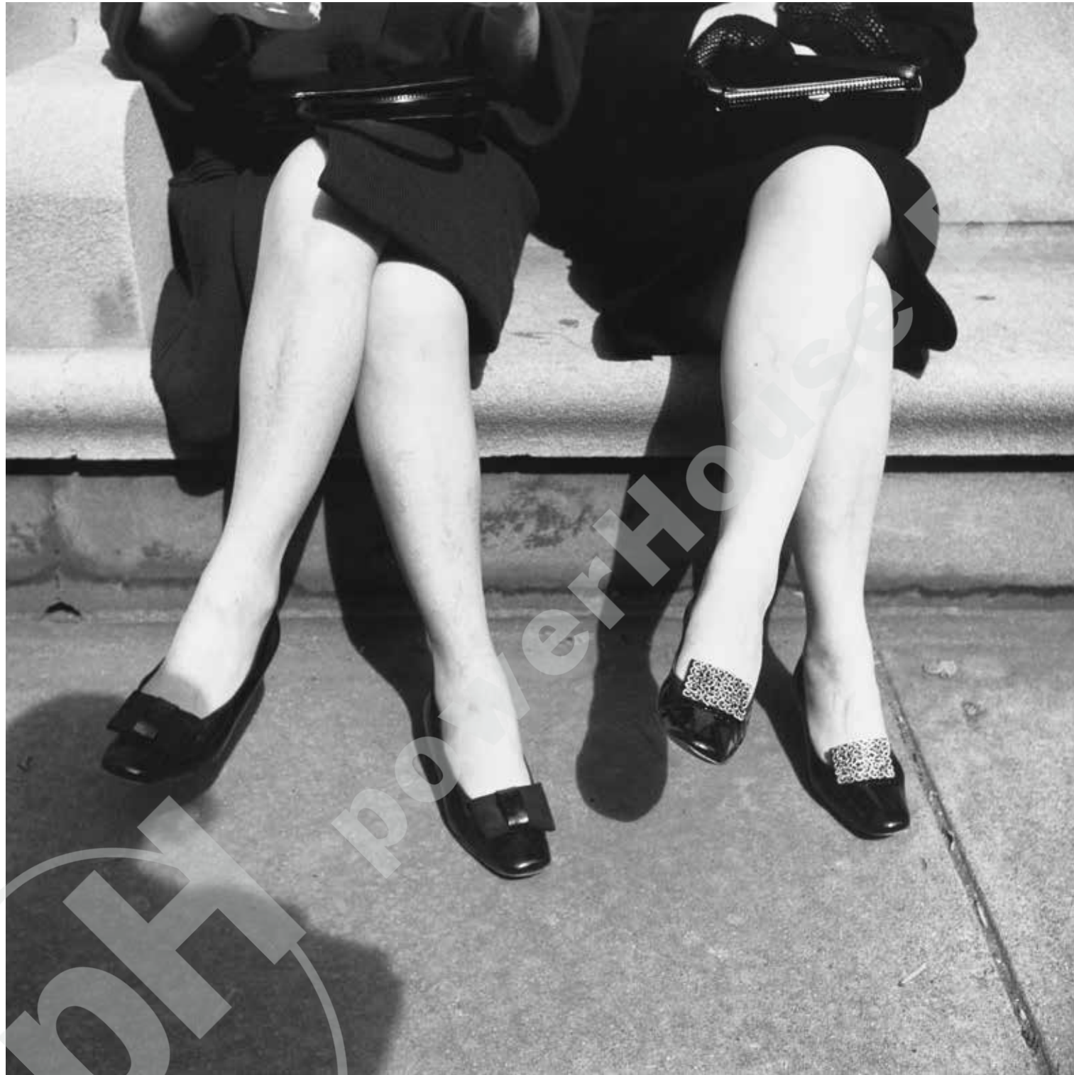
1970 - Chicago