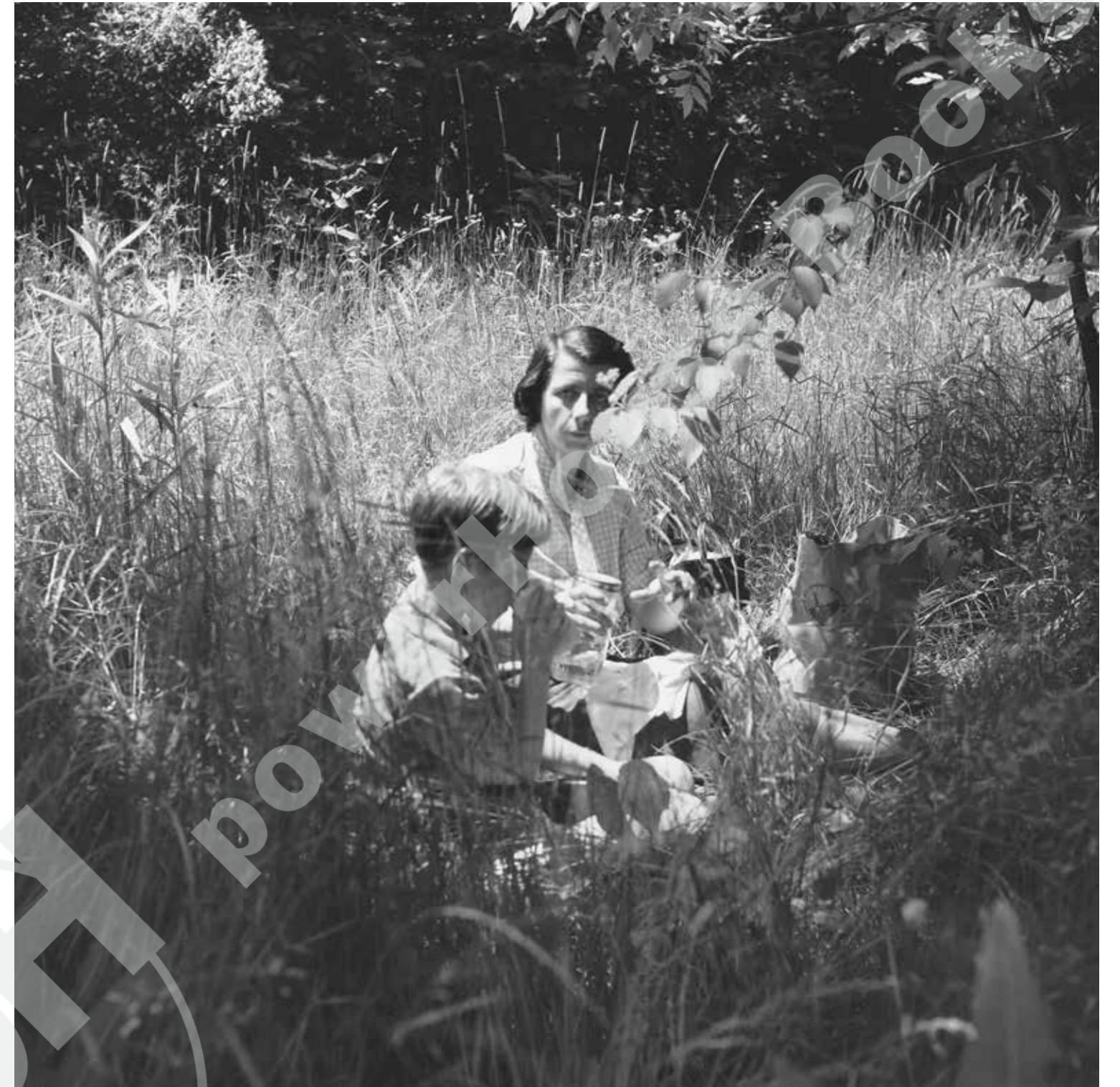
July 1966 – Chicago area