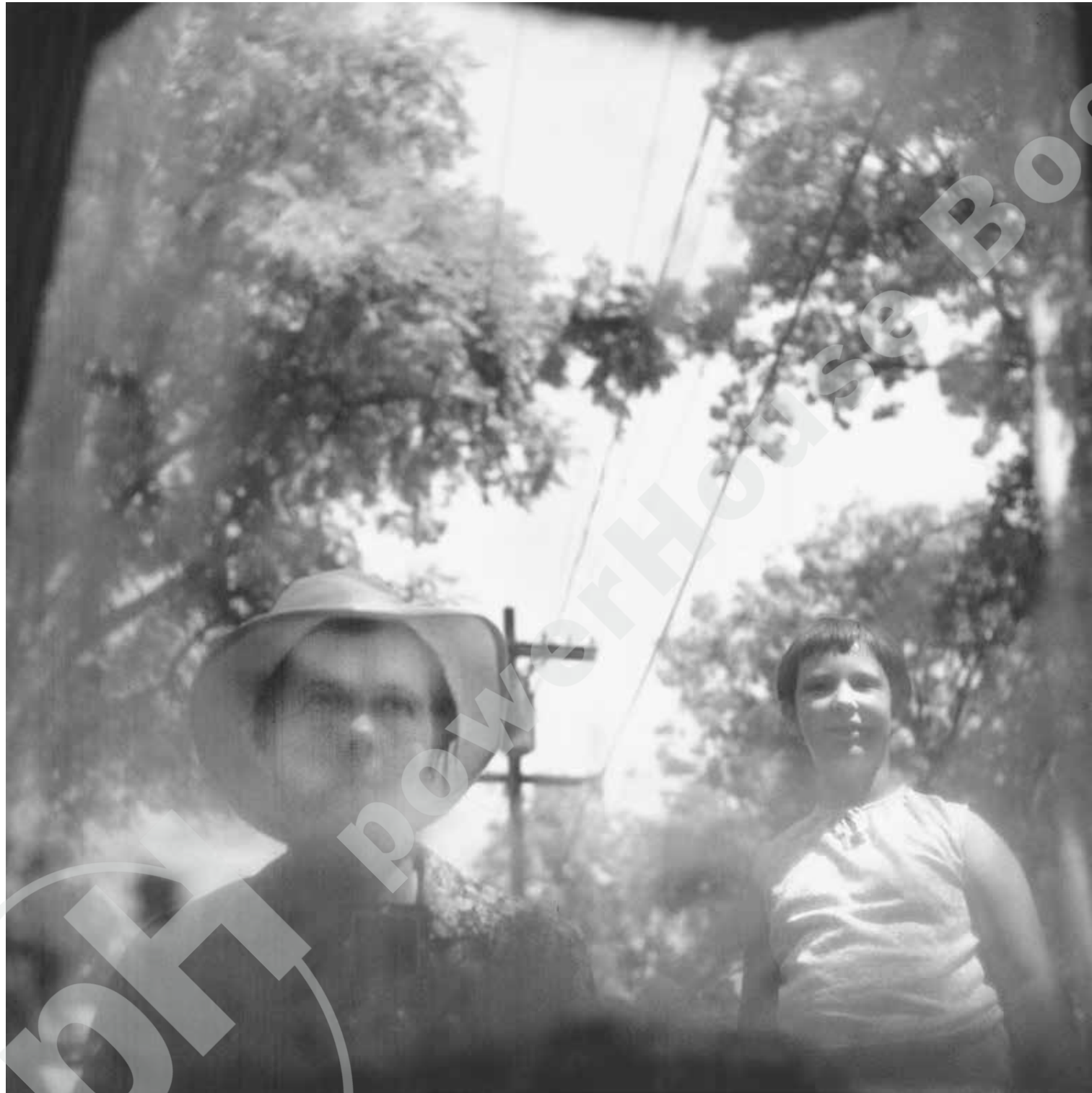
1970s – Chicago area