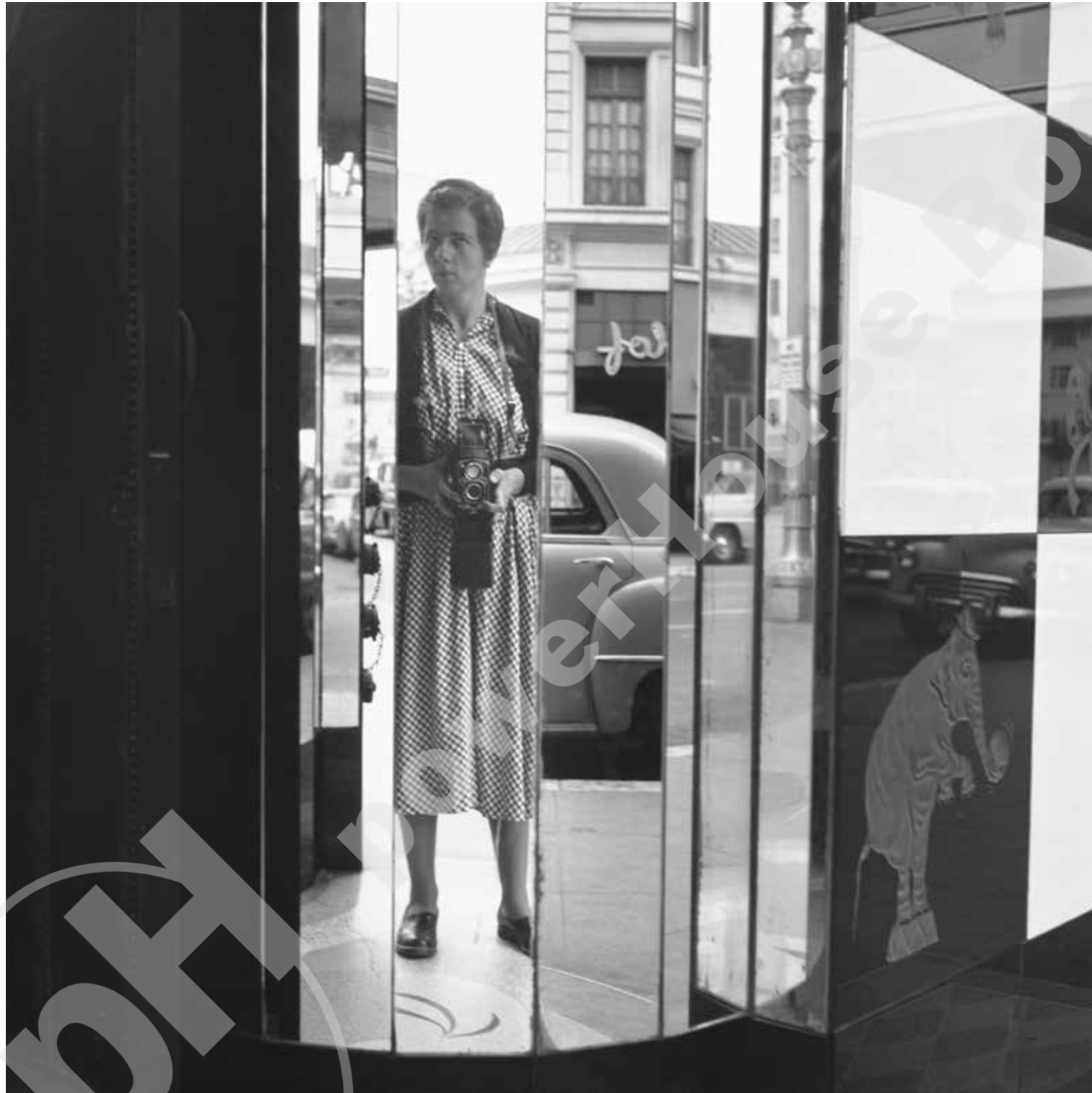
September 25, 1955 – San Diego, California