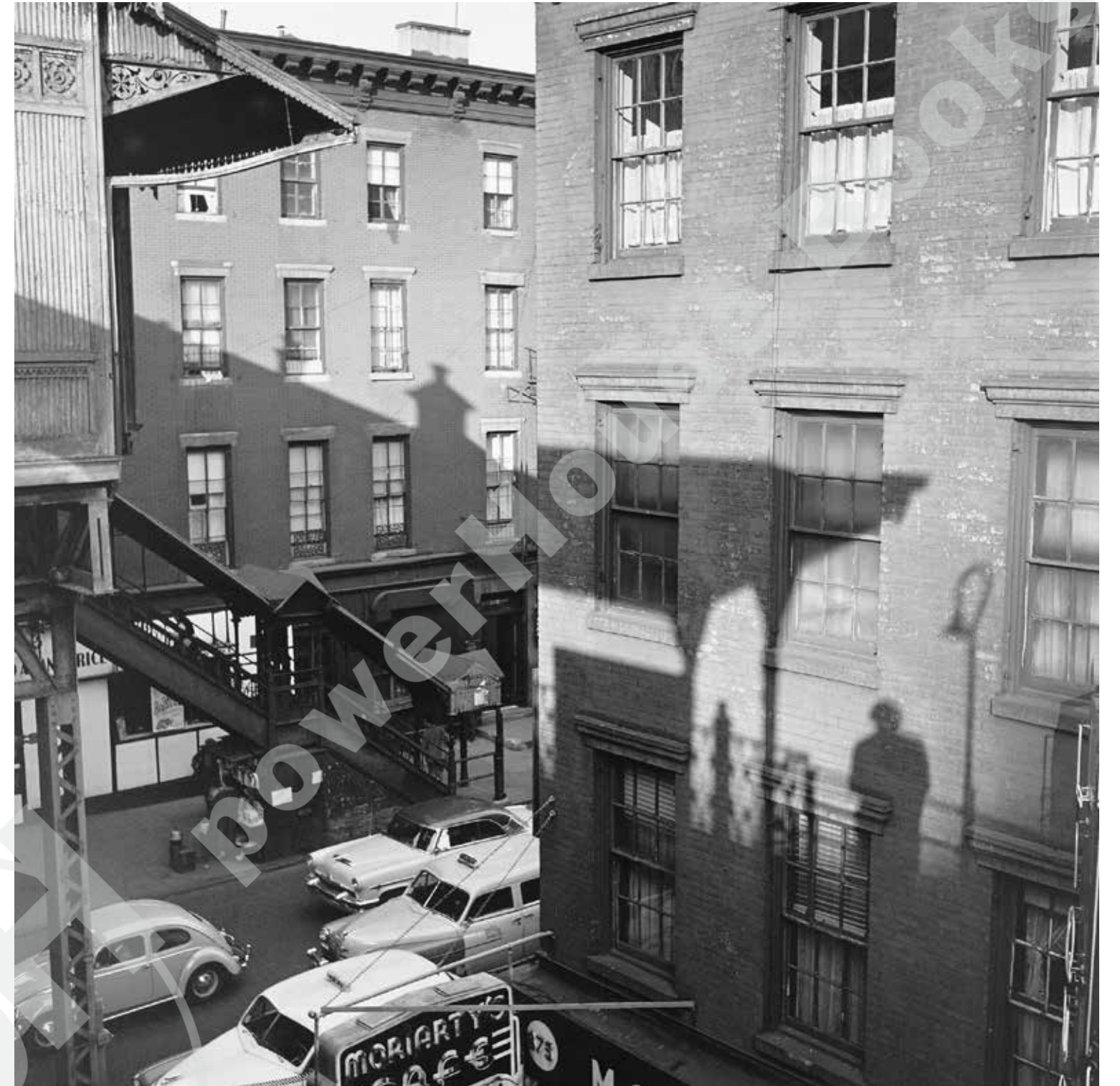
1955 - New York