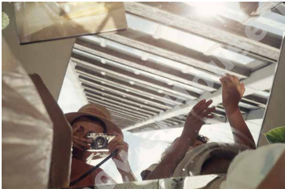
July 1975 – Chicago area