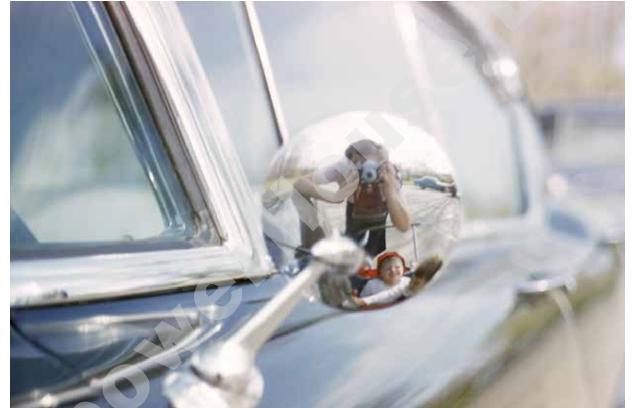
Undated - Chicago area