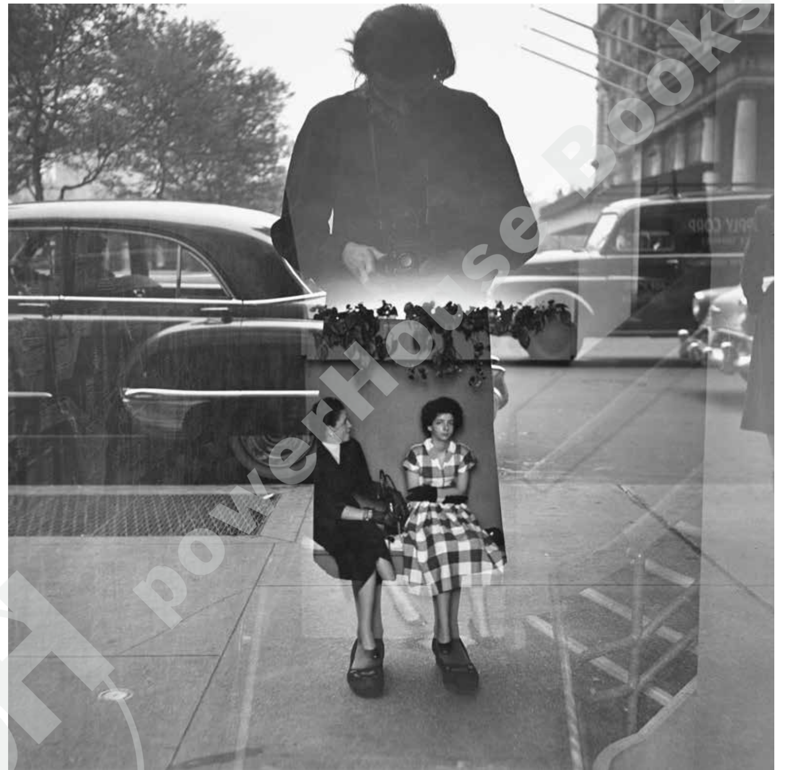
Undated - New York