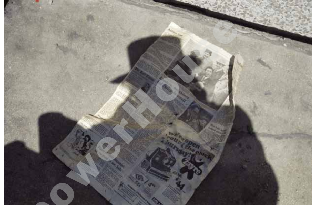
May 1977 – Chicago area