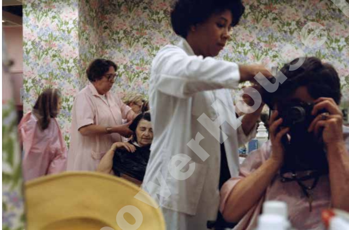
June 1978 – Chicago area